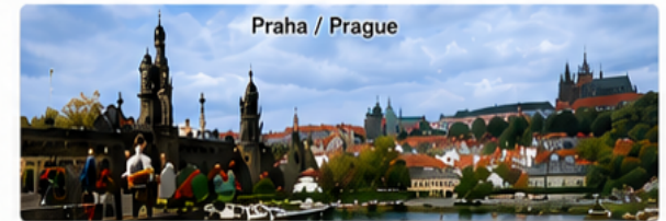
Praha / Prague